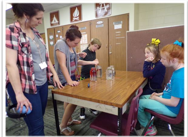
Students & staff at Open Door School work on a science project together